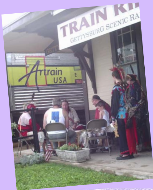
Left: Sacred Heart, a Native American drum and dance group, performs outside of the train in Gettysburg, Pennsylvania.