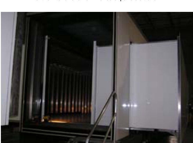
A view of an expandable trailer partially expanded.

You can watch a virtual fly-through of the new facility here . As always, Artrain USA is interested to hear what you think! Please email us at info@artrainusa.org or call 800-ART-1971.