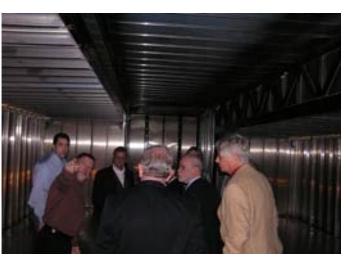
Members of Artrain USA's board and staff receive a tour of the interior of an unfinished expandable trailer.

Building upon our history of replicating museum facility standards in mobile railcars, Artrain USA is partnering with experts in the mobile exhibit industry - the Switch Agency in St. Louis - to modify the trailers to meet all museum environment and security requirements. These state-of-the-art trailers are in the planning and design stages. Recently, members of Artrain USA's board and staff toured the production facility.